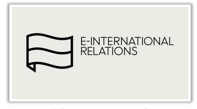
Online Resource: www.e-ir.info